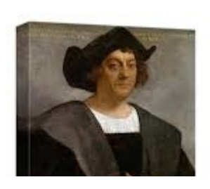
Columbus Day October 10

Because of YOU , we are able to maintain our goals of the study, preservation, and enjoyment of Italian Culture. Each donation, no matter the size, has an impact for NBICF. You can specify where your donation goes, such as the building fund, scholarships, or in memoriam, by indicating it on your check. Make your checks payable to NBICF , 64 Brookwood Avenue, Santa Rosa, CA 95404. Donations can also be made via our website, www.NBICF.org .